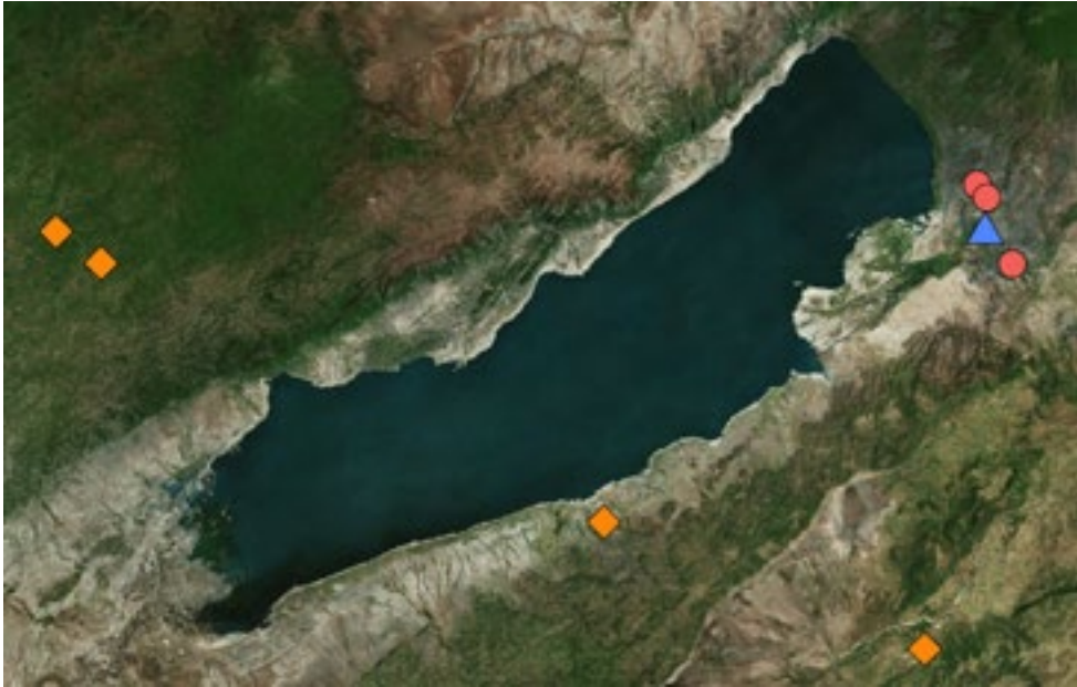
FIGURE 1. REGION INHABITED BY THE HADZA, AROUND LAKE EYASI

Notes: High exposure (HE) camps are marked with circles, and low exposure (LE) camps with diamonds. The triangle marks the Mangola village center.